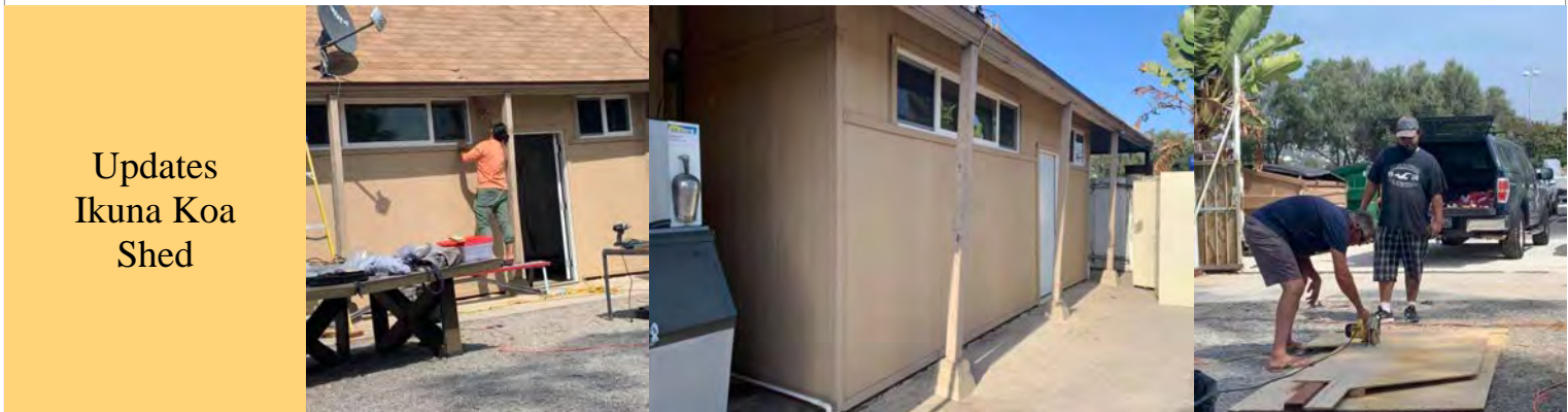
Updates Ikuna Koa Shed