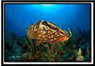
Enjoy the beautiful wildlife