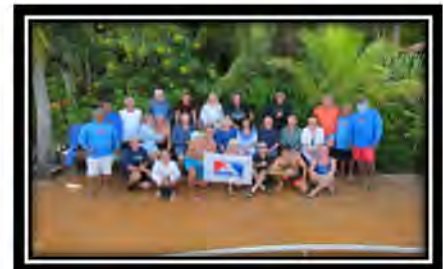
Enjoy a Beautiful Resort