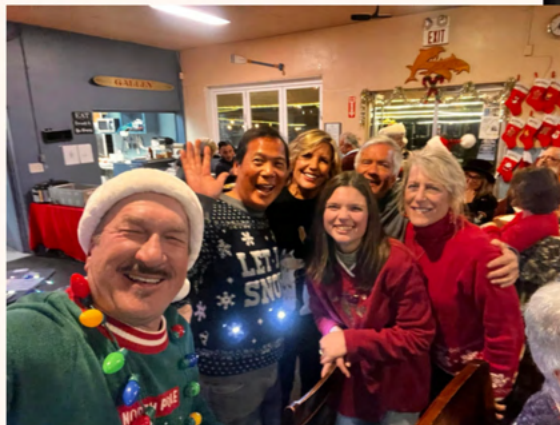
My apologies for not know all the names of those in the group photos.