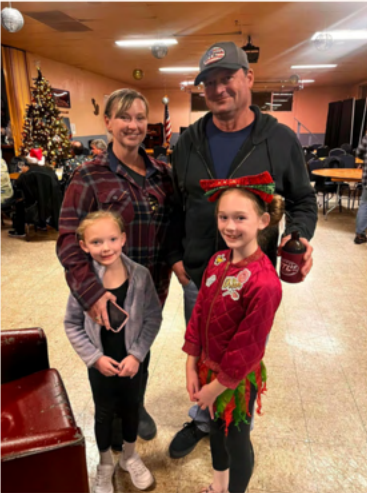
The Barnes Family