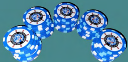
25 BOAT CLUB DRINKS