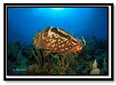
Enjoy the beautiful wildlife