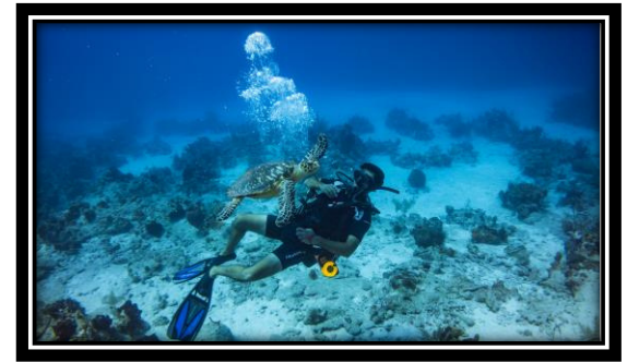
Dive the famous Bloody Bay Wall!

Create New Memories with Friends, Old and New!